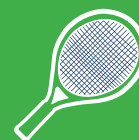
Racquet Up to 29"