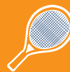
Racquet Up to 25"